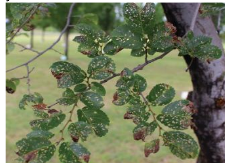
Classic European Elm Flea Weevil damage.

For more, information please check out this publication: European Elm Flea Weevil: Insect Pest of Elm Trees #MF3650